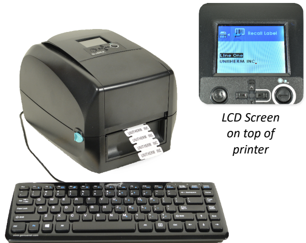
LCD Screen on top of printer